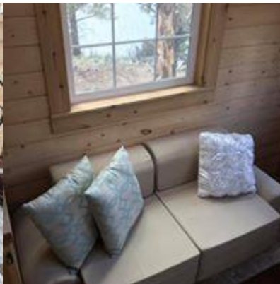
Convertible furniture sleeps 4