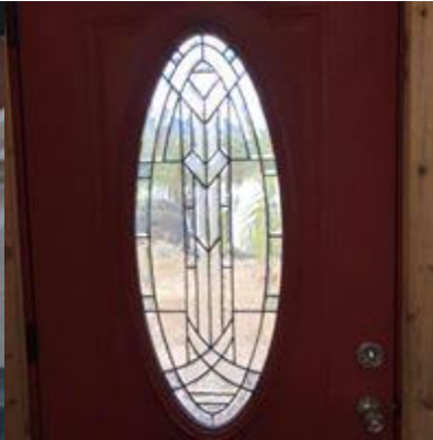
Elegant entrance door