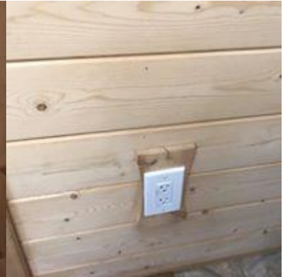
Custom electrical plates