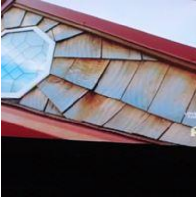
Sunburst custom shakes