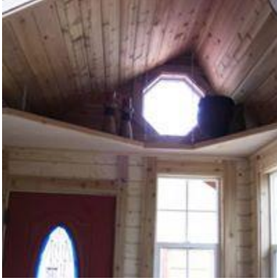
Second Storage loft