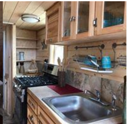
Full size sink