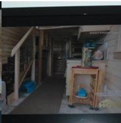
Custom art and multi-use furnishings