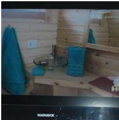
Linens and accessories throughout