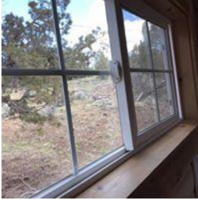
Low E windows – easy glide