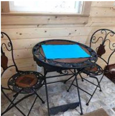
Antique folding table and chairs