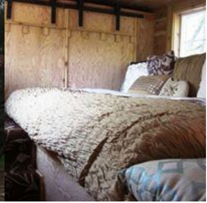
Barn Door Closet