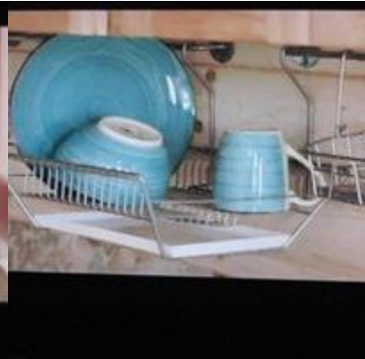
Multi-use draining racks