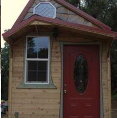
Custom woodwork with porch overhang